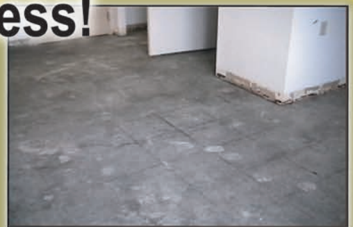
Ready to Resurface!